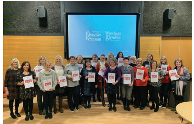
iHV perinatal and infant mental health training day

Additional funding has been secured from the Welsh Government to facilitate specialist PMH training. This year, 60 practitioners will be offered the iHV two-day course on perinatal and infant mental health , and a one-day course on postpartum psychosis , delivered by Action on Postpartum Psychosis .