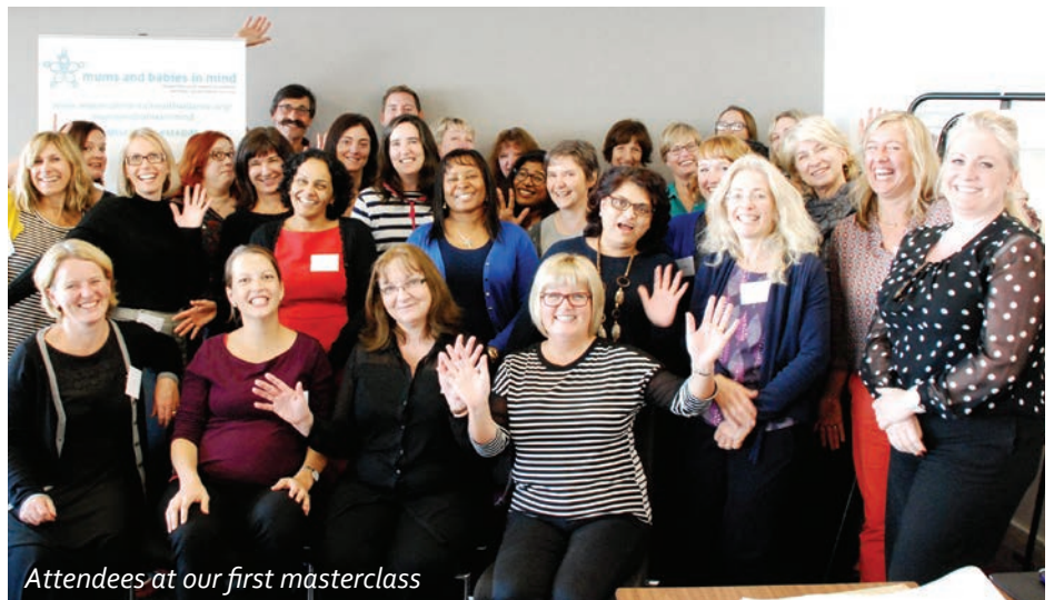
Attendees at our first masterclass

Mums and Babies in Mind (#MABIM) is a Maternal Mental Health Alliance Project supporting local leaders in four areas of England to improve services and care pathways for mums with perinatal mental health problems and their babies. We work in Blackpool, Gloucestershire, Haringey and Southend, but capture and share our work to inform and inspire other commissioners and providers across the UK. The project is hosted by The Mental Health Foundation and funded by the Big Lottery Fund .